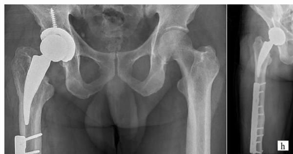
Fig. 3 The film five years after short stem THA.

THA, especially the lateral cortex of the proximal femur, which had been eroded by the multiple screws, was healed with bone ingrowth. Although the film X-ray of both hip AP showed stable fibrous ingrowth at the lateral side of the stem; however, the medial side of the stem showed stable fixation by bone ingrowth. There was no sign of loosening, no limb length discrepancy, no subsidence, or migration of short stem THA (Figure 3). The patient had no clinical hip pain, was able to walk normally, and was very satisfied with the result of treatment, and the Harris hip score was 93.