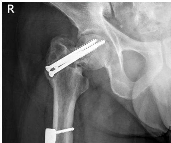
Fig. 1 Improper screws nearly protruding to the hip joint.

of the femoral head and delayed union of the femoral shaft (Figure 1). Because of the bone necrosis at the femoral head, the patient smoked heavily. Therefore, the surgeons considered it most appropriate to perform total hip arthroplasty (THA) surgery, which was the option of surgery rather than refixation or valgus osteotomy. Additionally, THA in this patient had another advantage. The bone graft obtained from the femoral head could be inserted into the femoral shaft fracture, which delays union. However, in this patient, if using conventional THA, there was a chance that the femoral stem would collide or affect the screw fixation at the shaft of the femur, which was still delayed union, and the screws could not be removed. Therefore, it was necessary to choose short stem THA even though the neck length could not be set to 5 mm, and the quality of the lateral cortex of the proximal femur was poor owing to a bone defect from multiple screws fixation.