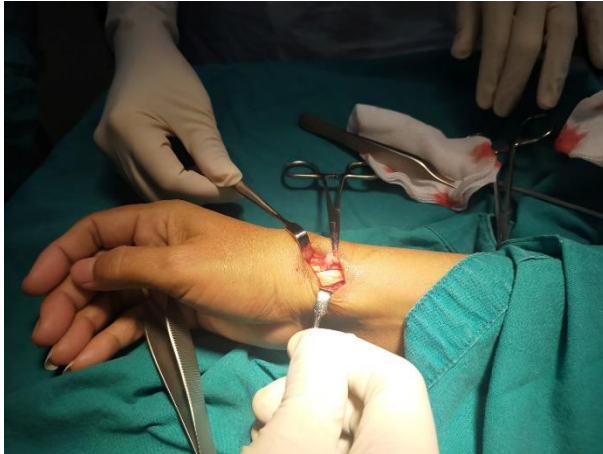
Fig. 2 The 1 st extensor retinaculum is cut in a step cut, with the ends defined as the distal ulnar and proximal radial bases.