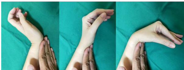
Fig. 4 Demonstration of physical examination of tendon subluxation. The examiner places their hand on the volar side of the patient's wrist while the wrist is extended. Then, the patient is asked to bend their wrist down slowly. Tendon subluxation can be detected during this examination.