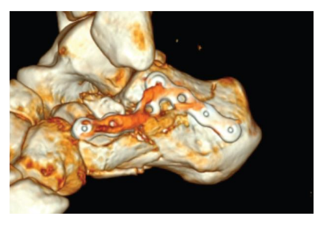
Fig. 1 Postoperative computed tomography scan of Sinus tarsi locking plate fixation.

This retrospective study analyzed data from 55 patients who underwent sinus tarsi locking plate fixation for joint depression-type calcaneal fractures (Fig. 1) at a tertiary hospital between 2019 and 2021. The study was approved by the institutional review board, and informed consent was obtained from all patients.